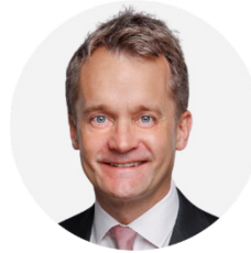
Seamus O'REGAN Outgoing Minister of Natural Resources, Canada