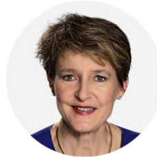
Simonetta SOMMARUGA Federal Councillor, Federal Department of the Environment, Transport, Energy and Communications, Switzerland