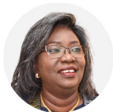
Co-Chair Sophie GLADIMA Minister for Petroleum and Energy, Senegal