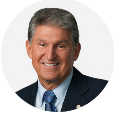
Joe MANCHIN Senator and Chairman of the Senate Committee on Energy and Natural Resources, United States