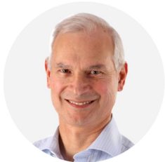
Jamshyd N GODREJ Chairperson, Council on Energy, Environment and Water