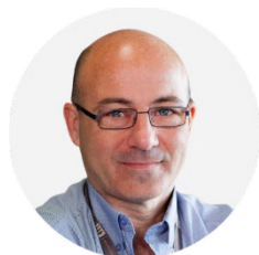
Roberto CINGOLANI Minister for Ecological Transition, Italy