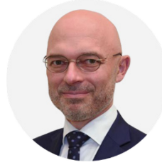
Michał KURTYKA Minister of Climate and Environment, Poland