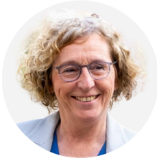
Muriel PÉNICAUD Ambassador at the Permanent Representative of France to the OECD, Former Minister of Labour, France