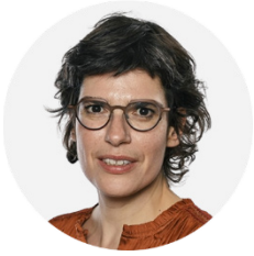
Tinne VAN DER STRAETEN Minister for Energy, Belgium