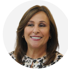
Rocío NAHLE GARCÍA Secretary of Energy, Mexico