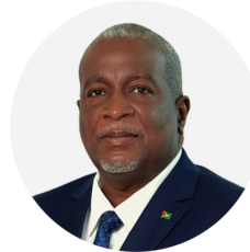
Mark PHILLIPS Prime Minister, Guyana