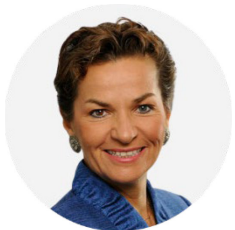
Christiana FIGUERES Founding Partner, Global Optimism Group