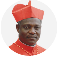
Cardinal Peter Kodwo Appiah TURKSON First Prefect of the Dicastery for the Promotion of Integral Human Development, Vatican