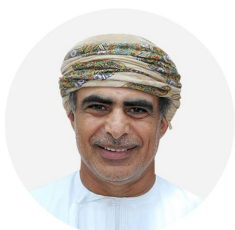
Mohammed Bin Hamed AL RUMHI Minister of Oil and Gas, Oman