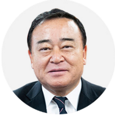
Hiroshi KAJIYAMA Former Minister of Economy, Trade and Industry, Japan