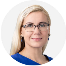
Kadri SIMSON European Commissioner for Energy