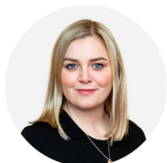
Tina BRU Former Minister of Petroleum and Energy, Norway