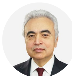
Fatih BIROL Executive Director, International Energy Agency