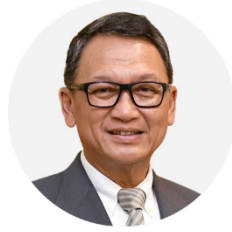
Arifin TASRIF Minister for Energy and Mineral Resources, Indonesia