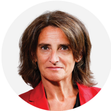
Teresa RIBERA RODRÍGUEZ Fourth Vice President of the Government, Minister for the Ecological Transition and the Demographic Challenge, Spain