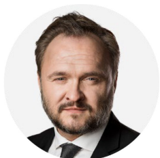
Chair Dan JØRGENSEN Minister for Climate, Energy and Utilities, Denmark